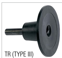
TR (TYPE III)