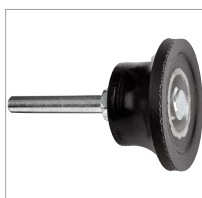
TS (TYPE II)

TIER: BEST BRAND: Norton TRADENAME: BLAZE R980P ABRASIVE: Ceramic Alumina FLAP: Polyester BACKING MATERIAL: Extra Heavy-Duty Plastic ATTACHMENT: TR (Type III)